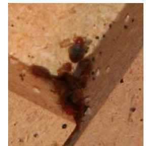
Bed bugs in crevices