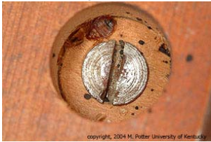
(M. Potter, Univ. of Kentucky)

Bed bugs hidden beside a recessed screw under a nightstand.