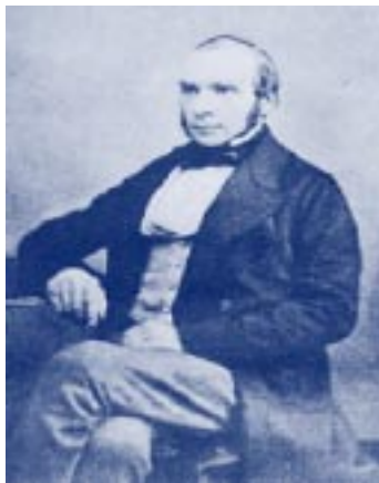
The "Father" of Modern Epidemiology Dr. John Snow (1813-1858)

Dr. John Snow is renowned worldwide for leadership in two medical disciplines. He was the first physician to practice full-time as an anesthetist, and actually delivered several of Queen Victoria's babies using chloroform. He is also recognized for using modern epidemiologic methods to interrupt the 1854 cholera epidemic in London. Dr. Snow mapped deaths from cholera and showed that the majority occurred within 250 yards of a water pump located at the intersection of Cambridge and Broad Streets. Suspecting the Broad Street pump as the source of disease, Dr. Snow had the water pump handle removed, thus ending the epidemic.